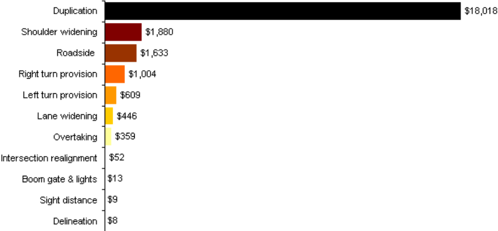
Figure 3. Total Investment by Road Safety Countermeasure ($ million)